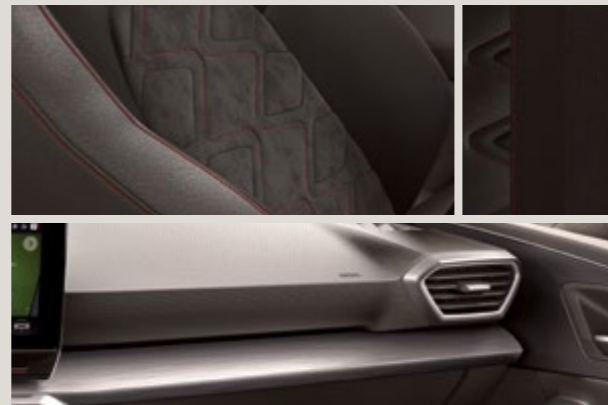
DINAMICA® SPORT SEATS