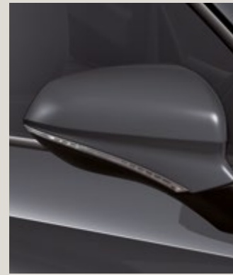
GRAPHENE GREY 3 FR