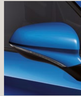
SAPPHIRE BLUE 2 St FR