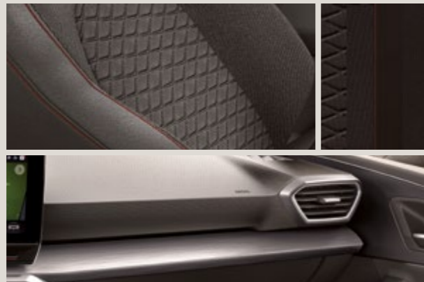
CLOTH COMFORT SEATS