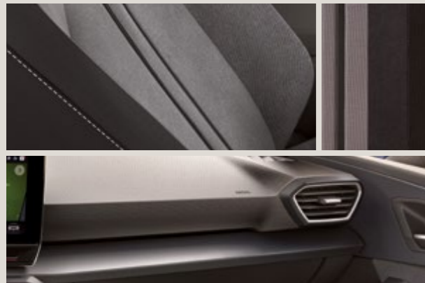
CLOTH COMFORT SEATS