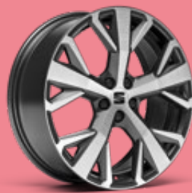
PERFORMANCE 18" NUCLEAR GREY MACHINED ALLOY WHEELS XP