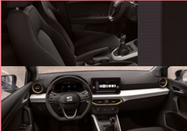
COMO CLOTH COMFORT SEATS