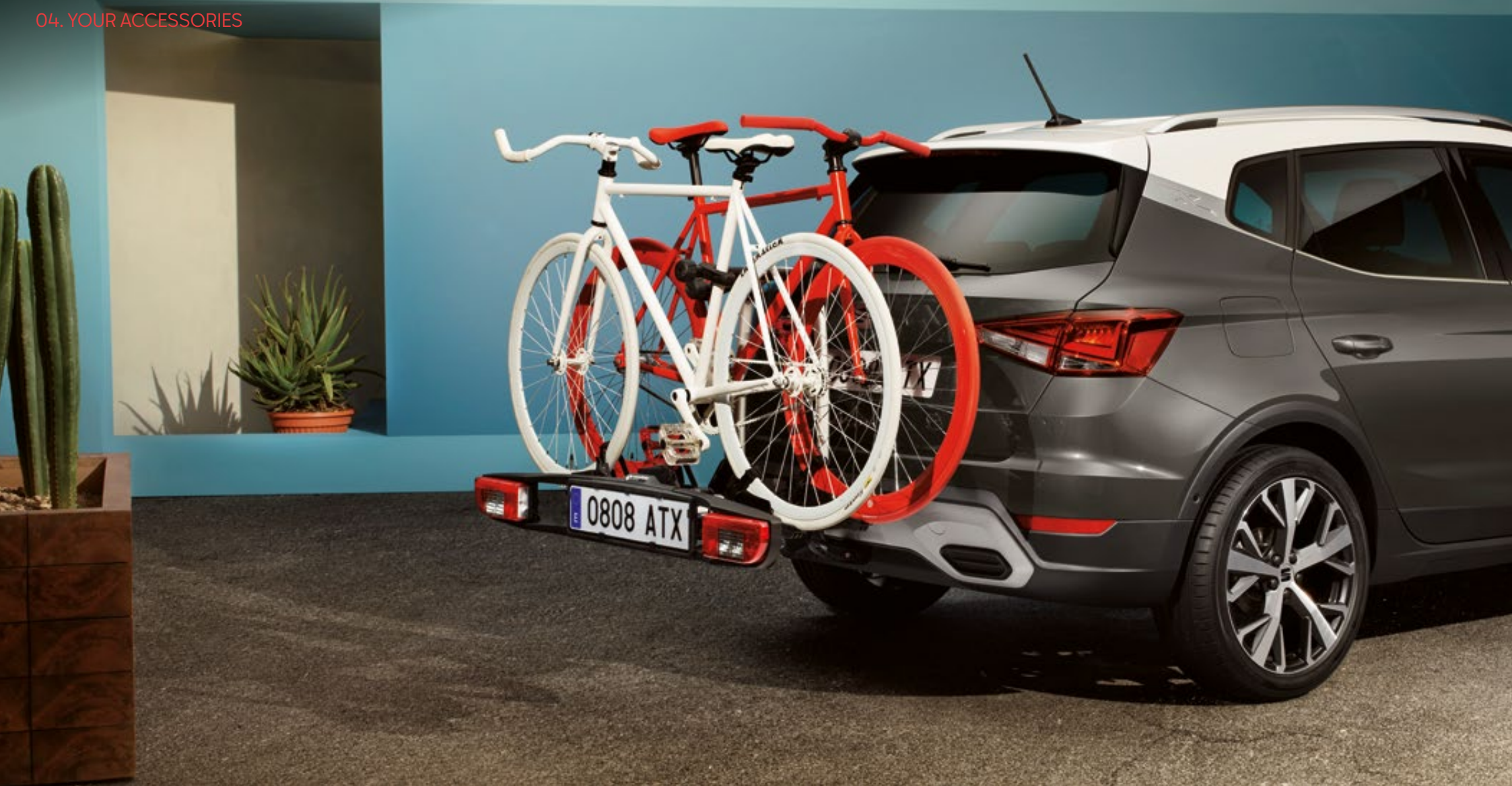
Towing bike rack The towing bike rack fits easily to the tow bar can carry 2 bicycles.