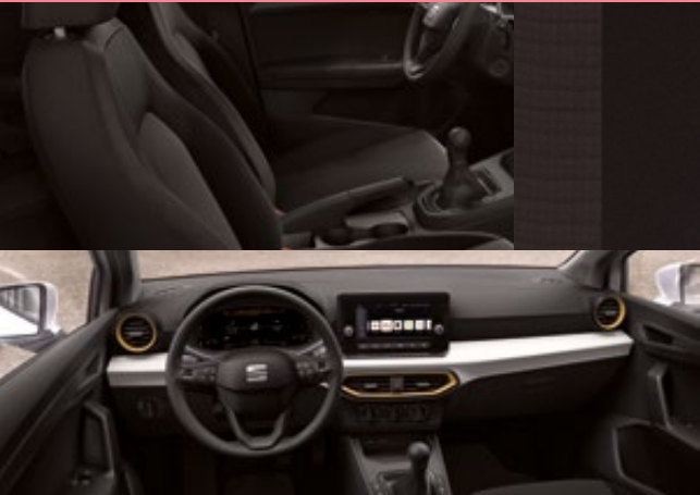
ACERO CLOTH COMFORT SEATS