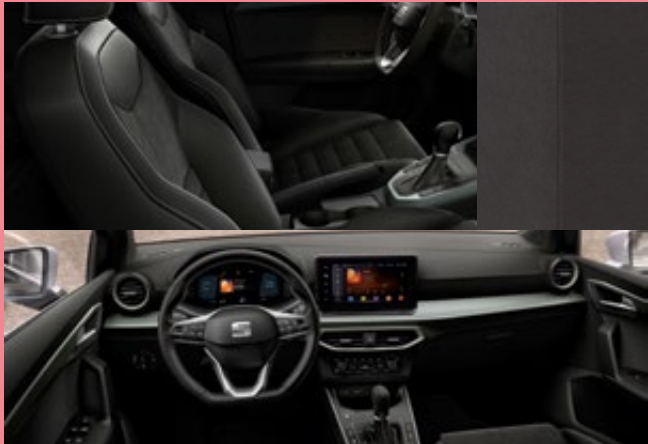
DINAMICA® BLACK SPORT SEATS