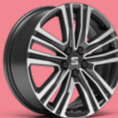
DYNAMIC 17" NUCLEAR GREY MACHINED ALLOY WHEELS St