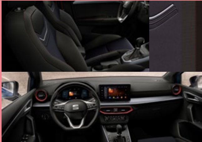
LE MANS CLOTH SPORT SEATS