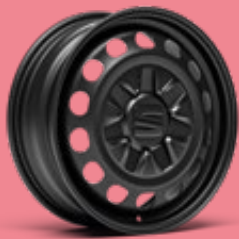
DESIGN 16" STEEL WHEELS R