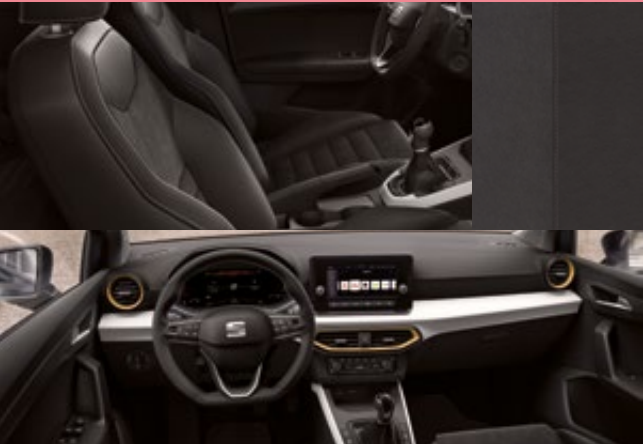
DINAMICA® BLACK SPORT SEATS