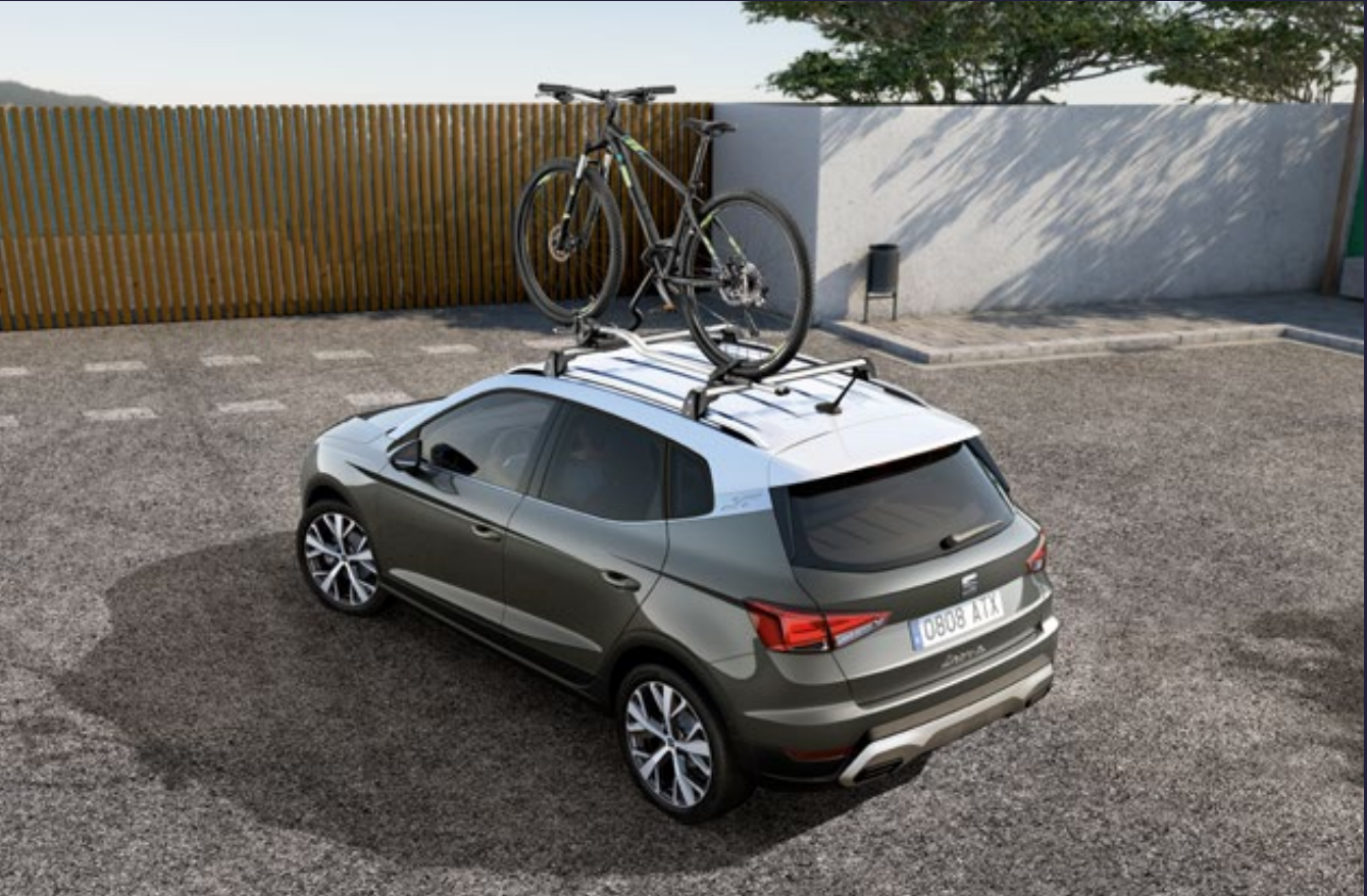
Take your bike to the extremes when you need to feel the wind in your face. Bike rack Transport your bike on your roof with easy and secure loading and unloading.