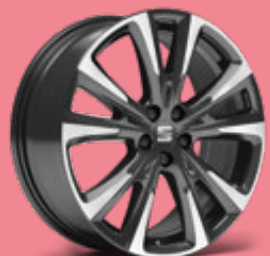
PERFORMANCE 18" NUCLEAR GREY ALLOY WHEELS St XP