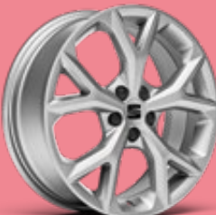
DYNAMIC 17" SPORT BRILLIANT SILVER ALLOY WHEELS FR