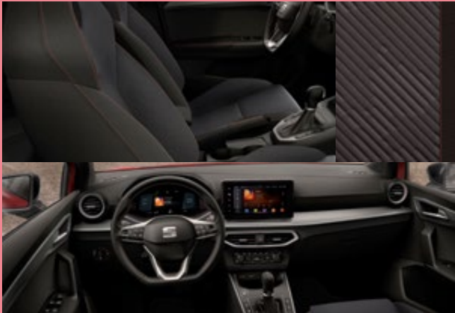
CLOTH BUCKET SEATS²