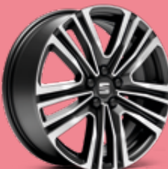
DYNAMIC 17" SPORT BLACK ALLOY WHEELS 1 St XP