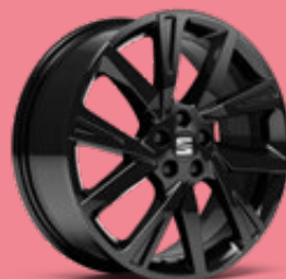
BLACK 18" ALLOY WHEELS FR