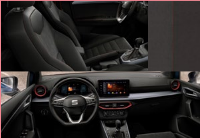
DINAMICA® BLACK SPORT SEATS