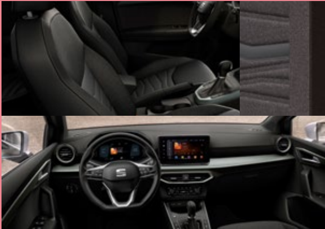
SANO CLOTH COMFORT SEATS