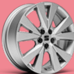
DYNAMIC 17" BRILLIANT SILVER ALLOY WHEELS XP