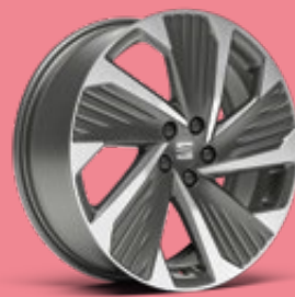
PERFORMANCE 18" COSMO GREY MATTE MACHINED ALLOY WHEELS FR