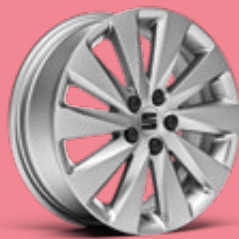
DESIGN 16" BRILLIANT SILVER ALLOY WHEELS R St