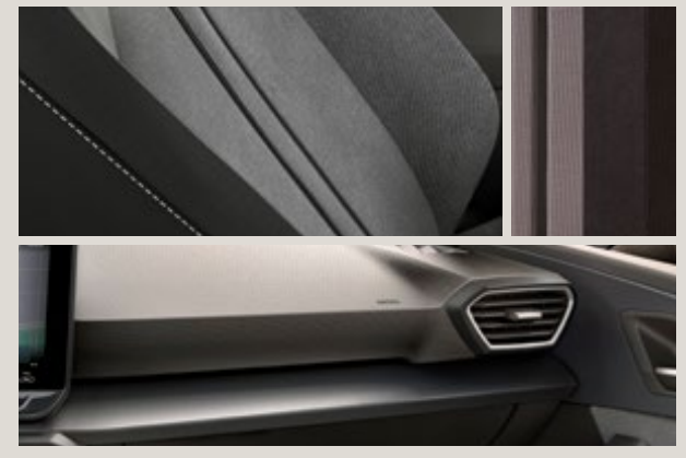
CLOTH COMFORT SEATS