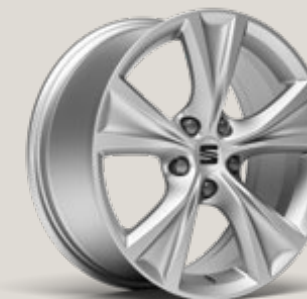
DYNAMIC 17" BRILLIANT SILVER ALLOY WHEELS FR