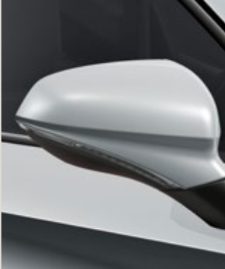
GLACIAL WHITE 2 St FR