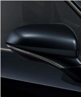
FIORD BLUE 1 St FR