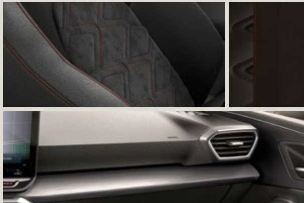
DINAMICA® SPORT SEATS