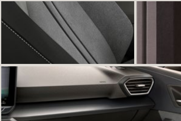
CLOTH COMFORT SEATS