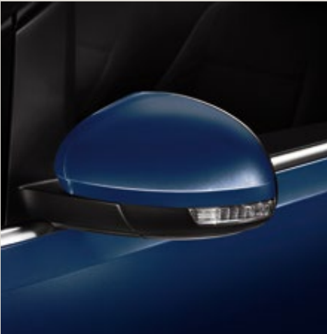
Atlantic Blue 2 St XE FR