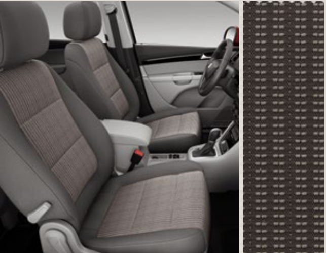
Cloth Dark Grey and Grey Comfort seats XC St