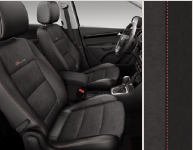
Alcantara® Black sport seats FR-Line FL + PFR FR