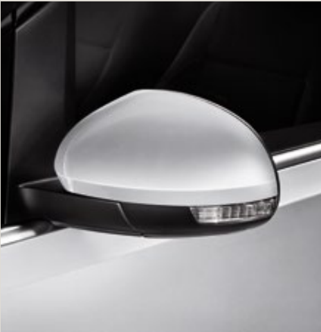
White Silver 2 St XE FR