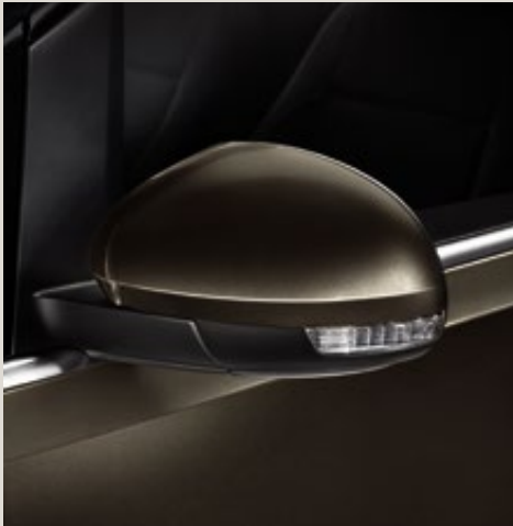
Black Oak Brown 2 St XE FR