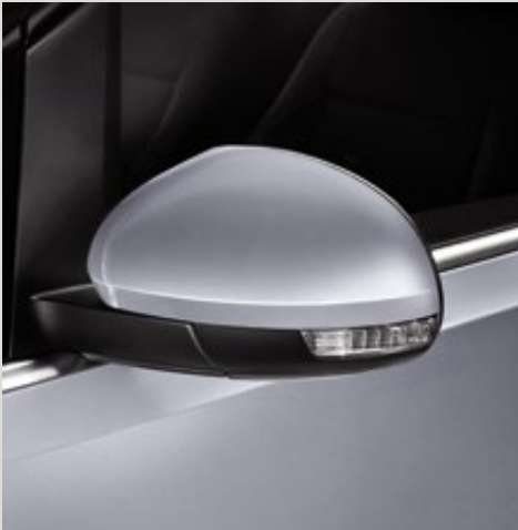
Moonstone Silver 2 St XE FR