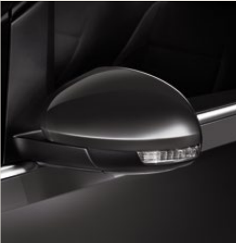
Urano Grey 1 St XE FR