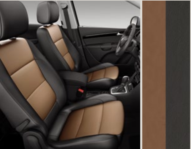
Leather Black and Cognac Sport seats XY + WL1 St XE