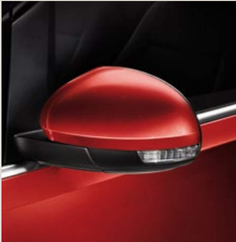
Romance Red 2 St XE FR

Style St Xcellence XE FR-Line FR Standard ■ Optional ■