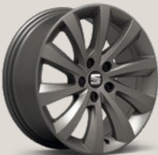
Dynamic 48/1 Atom Grey St