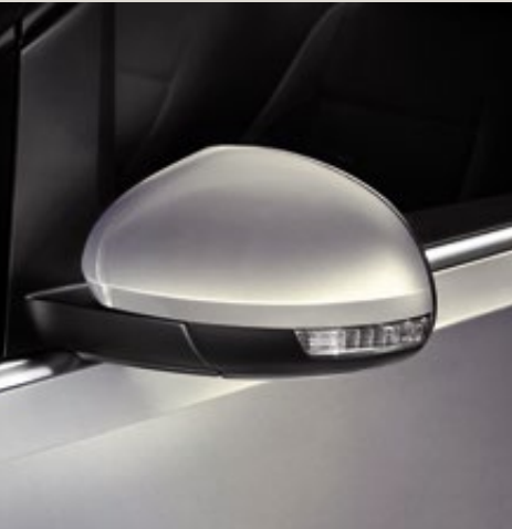
Reflex Silver 2 St XE FR