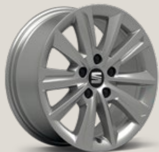
Design 48/1 St