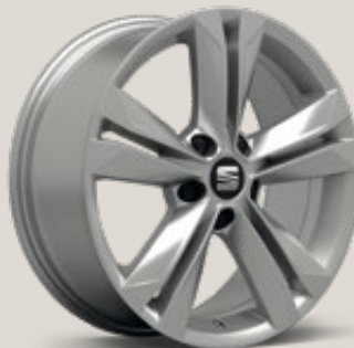
Dynamic 48/2 XE