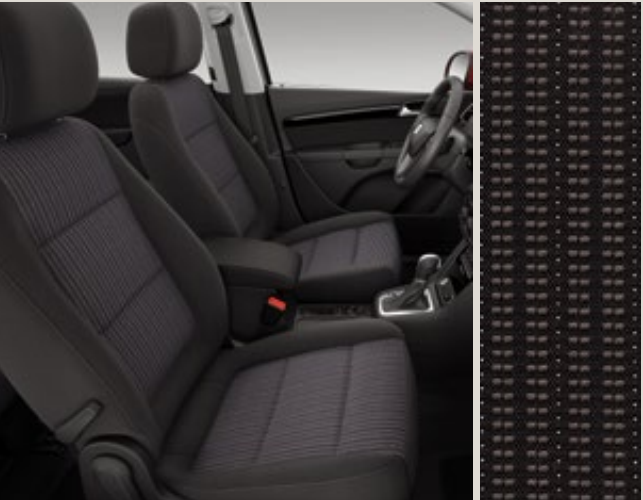
Cloth Black and Grey Comfort seats DM St