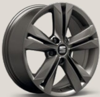
Dynamic 48/2 Atom Grey St