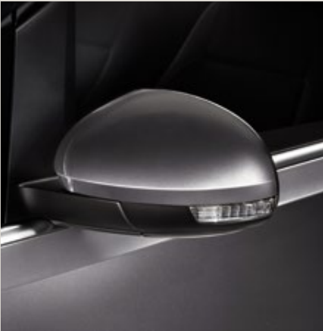
Indium Grey 2 St XE FR