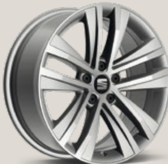
Akira St XE