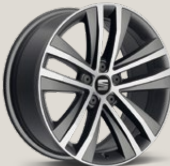
Akira Atom Grey FR