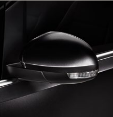
Deep Black 2 St XE FR