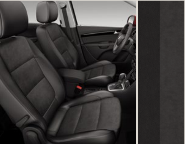
Alcantara® Black Sport seats JJ + PLT St XE