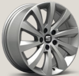
Dynamic 48/1 St