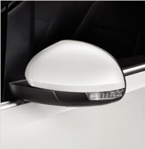
Pure White 1 St XE FR