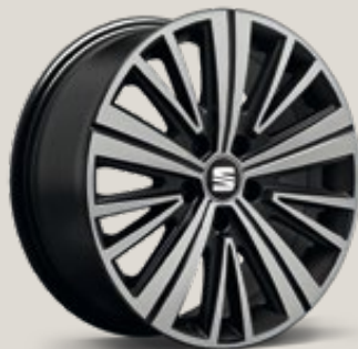
Dynamic 48/3 Glossy Black St XE