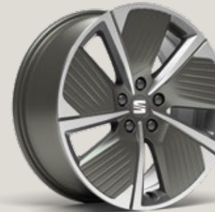
PERFORMANCE 18" MACHINED NUCLEAR GREY AEROWHEEL 1 XC