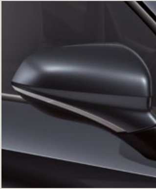
MAGNETIC TECH R St XC FR