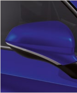
MYSTERY BLUE R St XC FR