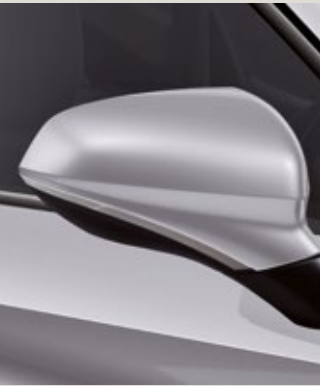
URBAN SILVER R St XC FR