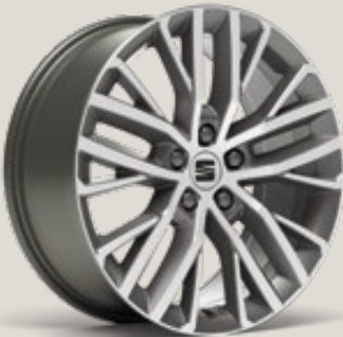
PERFORMANCE 18" MACHINED NUCLEAR GREY ALLOY WHEELS XC