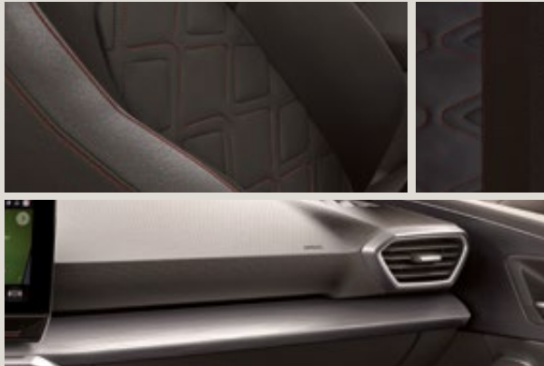
NAPPA LEATHER BLACK 2