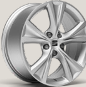
DYNAMIC 17" ALLOY WHEELS FR