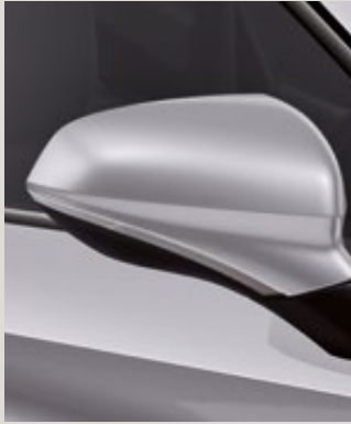
URBAN SILVER 2 R St XC FR