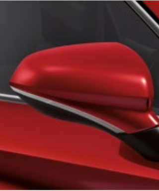
DESIRE RED XC FR