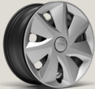
URBAN 16" STEEL WHEELS R