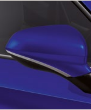
MYSTERY BLUE R St XC FR