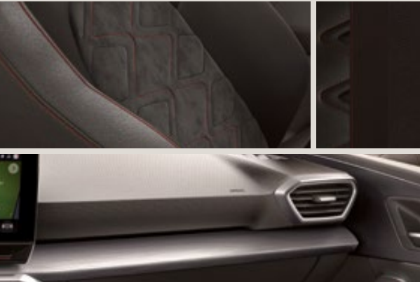
DINAMICA MICROFIBER 1