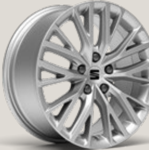
DYNAMIC 17" ALLOY WHEELS XC