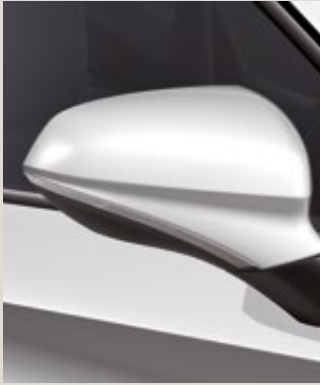
CANDY WHITE R St XC FR