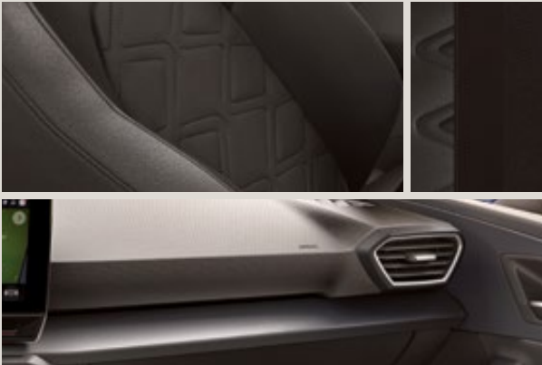
NAPPA LEATHER BLACK 2