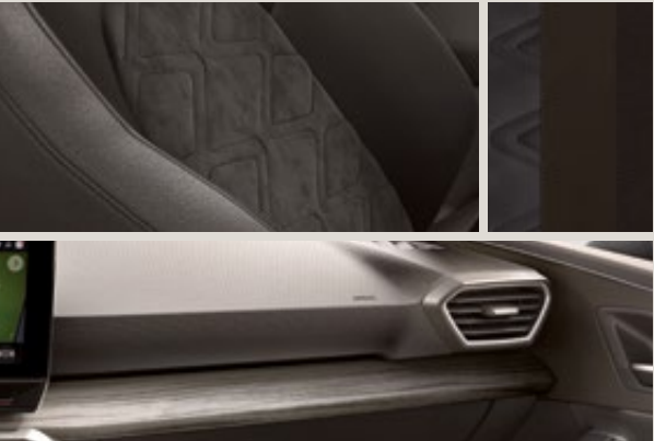
DINAMICA MICROFIBER 1