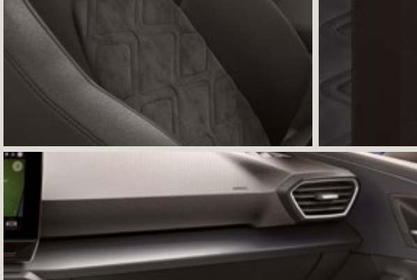
DINAMICA MICROFIBER 1