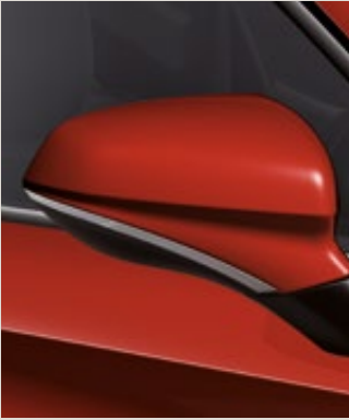
PURE RED R St XC FR