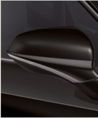
MIDNIGHT BLACK R St XC FR

Reference R Style St Xcellence XC FR FR Serial ■ Optional ■