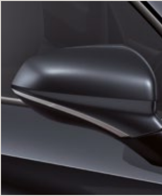
MAGNETIC TECH R St XC FR