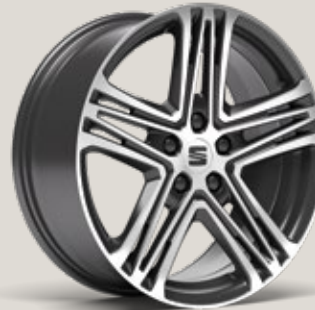
PERFORMANCE 18" 30/8 MACHINED NUCLEAR GREY ALLOY WHEELS XC