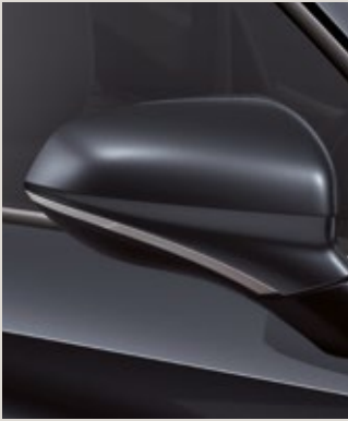
MAGNETIC TECH R St XC FR