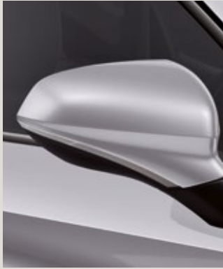
URBAN SILVER R St XC FR