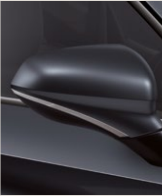
MAGNETIC TECH MATT¹ XC FR