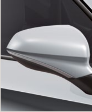
NEVADA WHITE R St XC FR