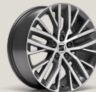
PERFORMANCE 18" 30/4 NUCLEAR GREY MACHINED ALLOY WHEELS 2 XC