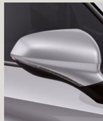
URBAN SILVER 2