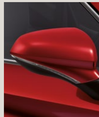
DESIRE RED 3