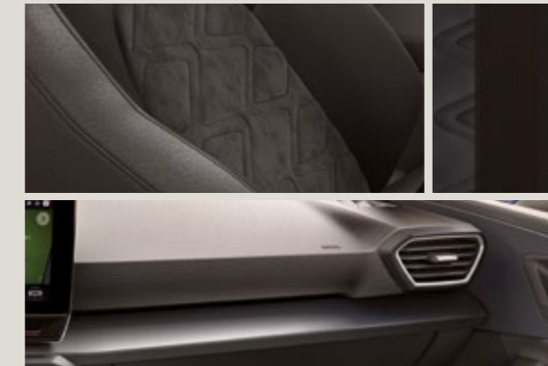
DINAMICA® SPORT SEATS