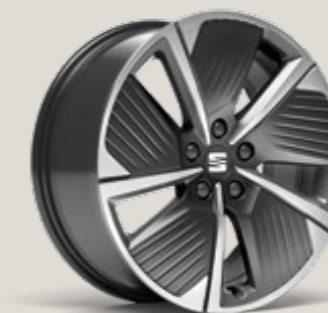
PERFORMANCE 18" 30/10 NUCLEAR GREY MACHINED AERO WHEELS 2 XC