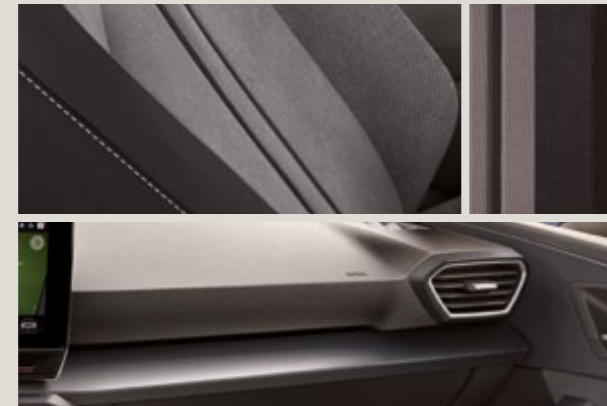
CLOTH COMFORT SEATS