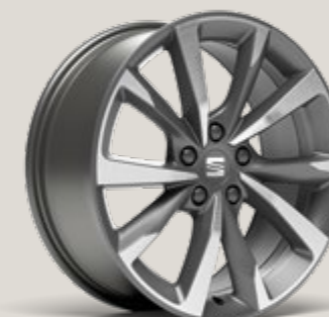
PERFORMANCE 18" 30/6 COSMO GREY MACHINED ALLOY WHEELS 2 FR