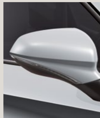
NEVADA WHITE 2