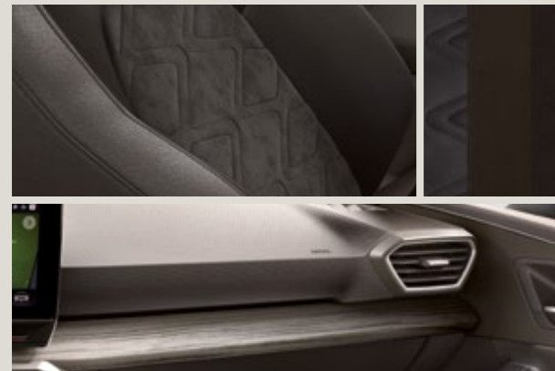
DINAMICA® SPORT SEATS