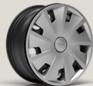
URBAN 15" STEEL WHEELS R