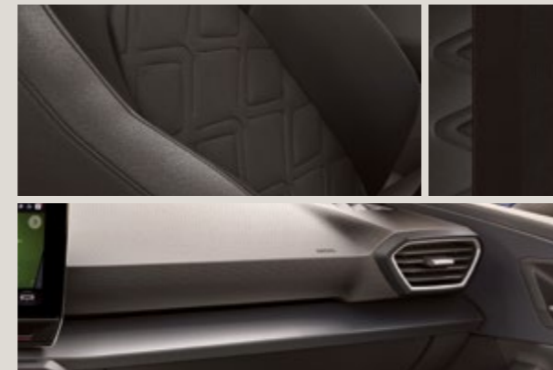
LEATHER BLACK SPORT SEATS