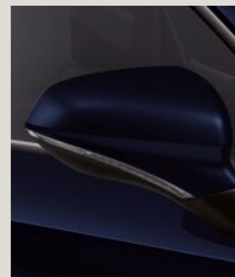
ASPHALT BLUE 2