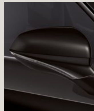
MIDNIGHT BLACK 2