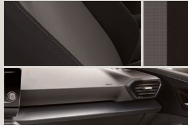
CLOTH COMFORT SEATS