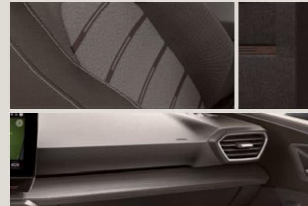
CLOTH COMFORT SEATS