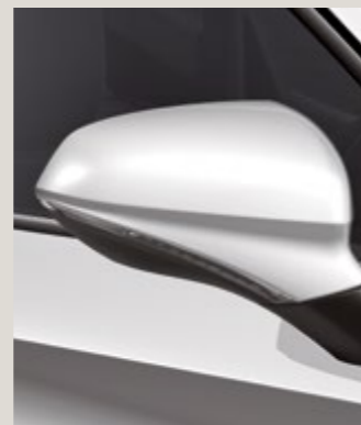
CANDY WHITE 1