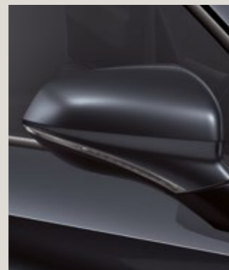
MAGNETIC TECH 2