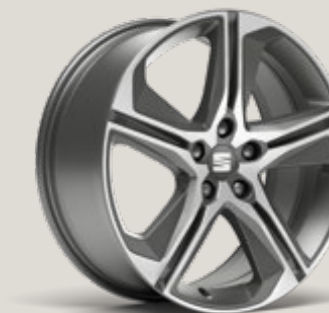
PERFORMANCE 18" 30/9 COSMO GREY MACHINED ALLOY WHEELS 2 FR