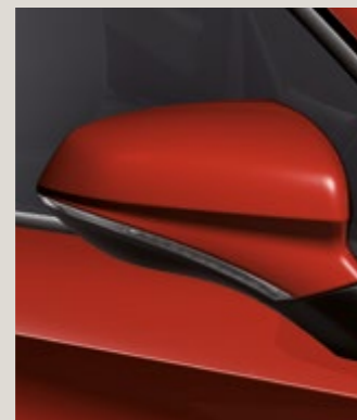
PURE RED 1