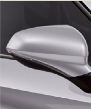
URBAN SILVER 2 St FR