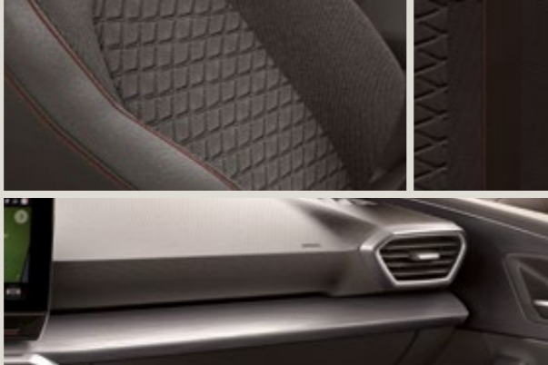
CLOTH COMFORT SEATS