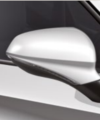
CANDY WHITE 1 St FR