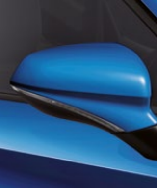
SAPPHIRE BLUE 2 St FR