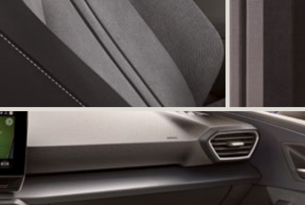
CLOTH COMFORT SEATS