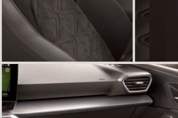
DINAMICA® SPORT SEATS