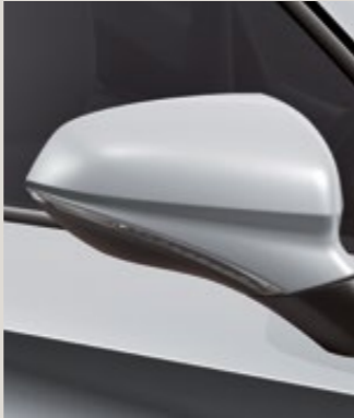
NEVADA WHITE 2 St FR