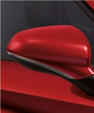
DESIRE RED 3 FR