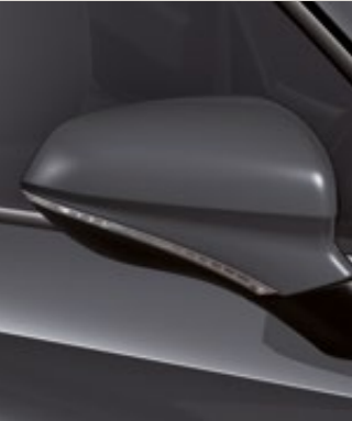
GRAPHENE GREY 3 FR