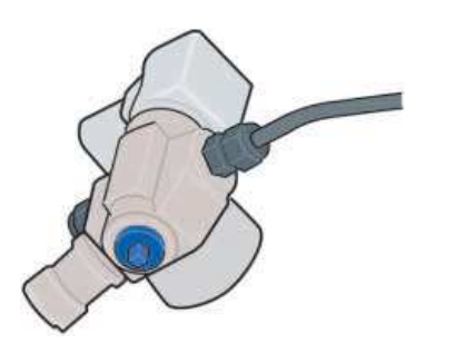
Manual shut-off valve on the foot of the cylinder valve.

• Each gas tank has its own cylinder valve with a manual shutoff valve.